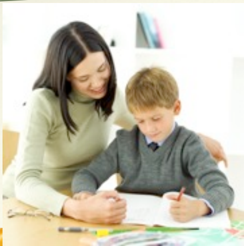
2 nd graders should have unknown words spelled phonetically correct, like "brekfist" for "breakfast"